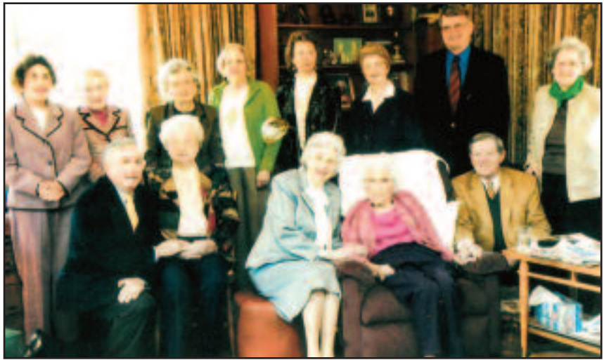
February 25, 2010 Neysa Coker Class and Teachers